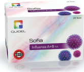
Influenza A+B FIA