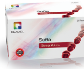
Strep A+ FIA